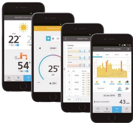
* User interface image may change without notification.