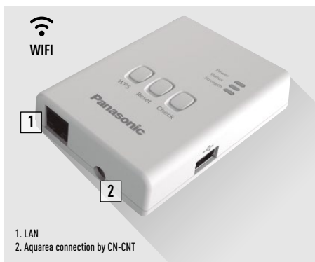
1. LAN 2. Aquarea connection by CN-CNT