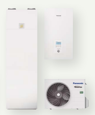
Heat Recovery Ventilation + DHW Square Tank + Aquarea Bi-bloc