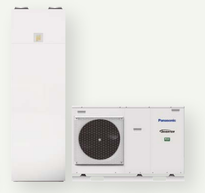
Heat Recovery Ventilation + DHW Square Tank + Aquarea Monobloc