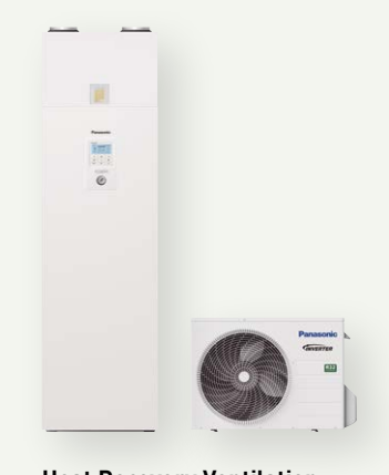
Heat Recovery Ventilation + Aquarea All in One Compact

Combine the Residential ventilation unit with Panasonic Aquarea for an space saving and highly efficient solution for heating, cooling, ventilation and DHW.